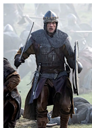
The BBC version of the battle was filmed on a farm in Iceland.