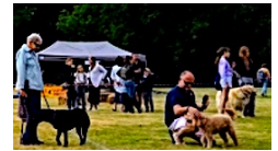
The 2024 competition

The Laughton Fete opens on the fields behind the Village Hall on Saturday 7th June from 2pm to 5pm; and Laughton's Top Dog Show starts at 3pm. The categories are Gorgeous Girl, Handsome Hound, Waggiest Tail/Wiggliest Bum, Superdog (with a disability), Best Buddies (child & dog) and Best Tricks, with prizes donated by The Pet Store, Ringmer.